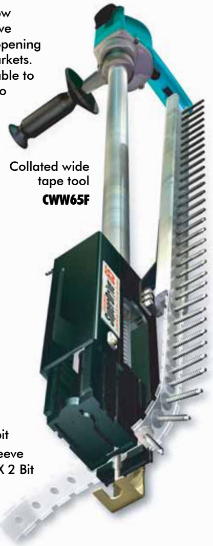
Collated wide tape tool CWW65F

A new dimension is now added to the SuperDrive Fastening potentials, opening new industries and markets. The SuperDrive 65 is able to drive screw heads up to 15mm in diameter.