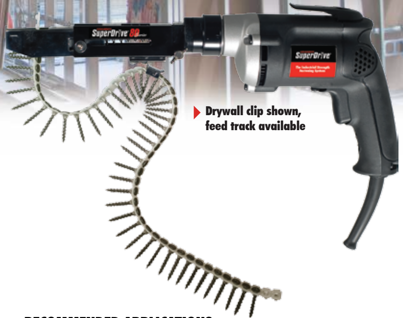
▶ Drywall clip shown, feed track available