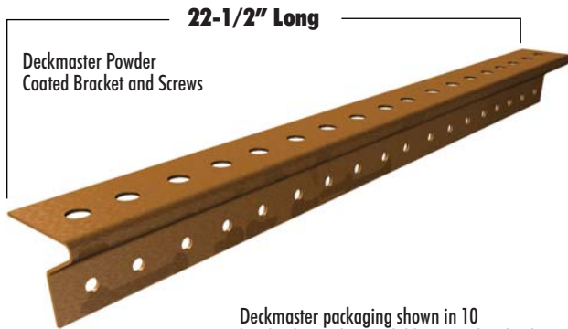
Deckmaster packaging shown in 10 bracket box. Also available in 100 bracket box.